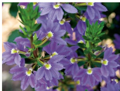
Scaevola 'New Wonder'