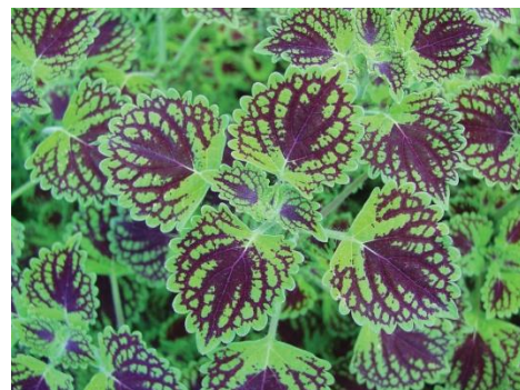
Coleus 'Chocolate Drop'