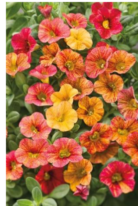
Calibrachoa 'Tequila Sunrise'