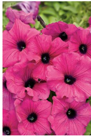
Pentunia 'Royal Magenta'