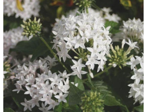
Pentas 'White Butterfly'