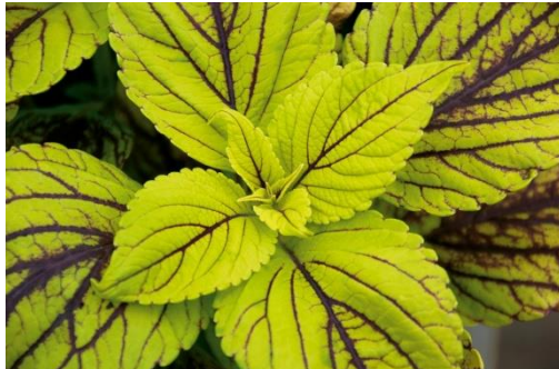
Coleus 'Gay's Delight'