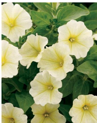
Pentunia 'Yellow Bush'