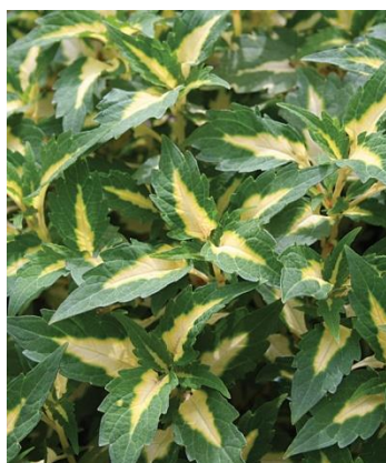
Coleus 'Alligator Tears'

Uses: Landscape beds, Borders, Containers