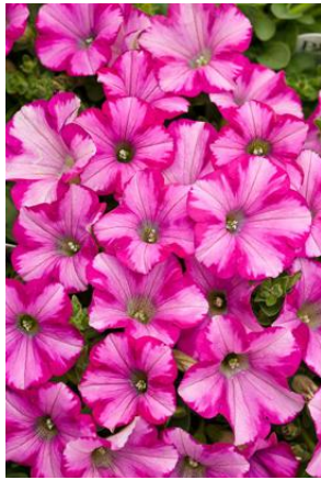
Pentunia 'Raspberry Blast'