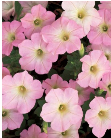
Pentunia 'Mini Appleblossom'