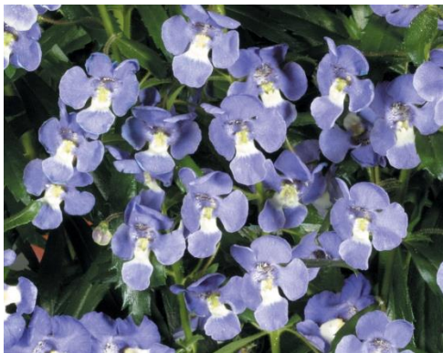
Angelonia 'Angelface Blue'

Uses: Containers, Cut flowers, Landscapes