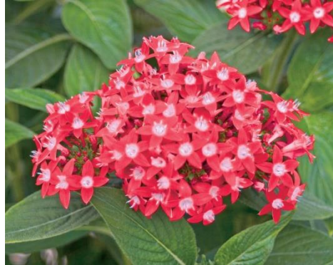
Pentas 'Red Butterfly'