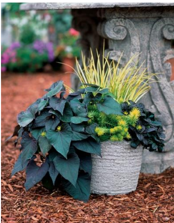
Ipomoea 'Black Heart'