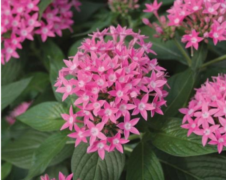
Pentas 'Deep Pink Butterfly'

Uses: Landscape beds, Containers, Cut flowers