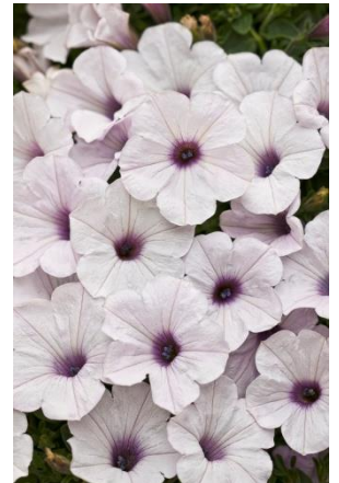
Pentunia 'Mini Silver'