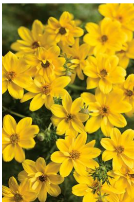
Bidens 'Goldilocks Rocks'