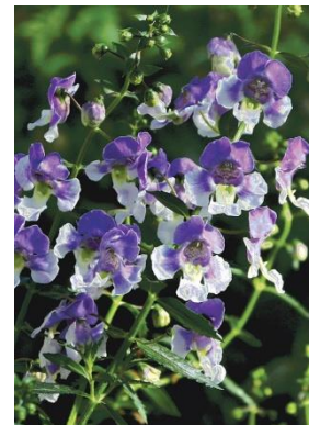
Angelonia 'Angelface Wedgewood'