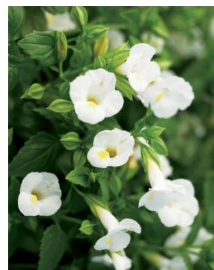
Torenia 'White Linen'