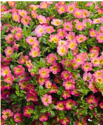
Calibrachoa 'Sweet Tart'