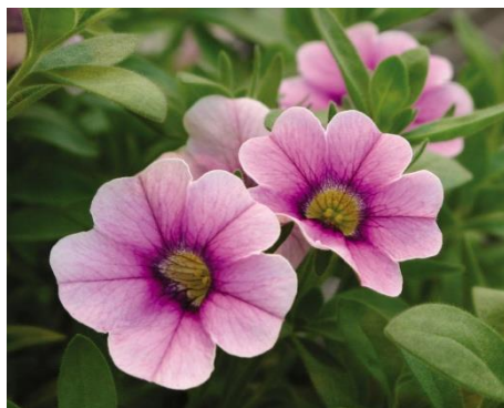
Calibrachoa 'Tickled Pink'