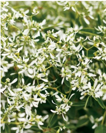
Euphorbia 'Diamond Frost'