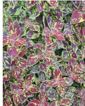
Coleus 'Splish Splash'