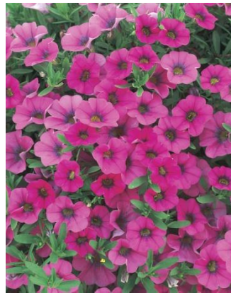
Calibrachoa 'Trailing Pink'