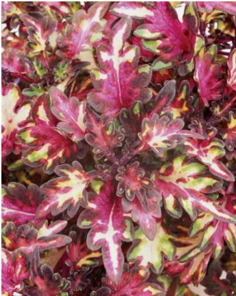
Coleus 'Merlin's Magic'