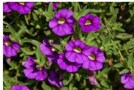
Calibrachoa 'Trailing Blue'