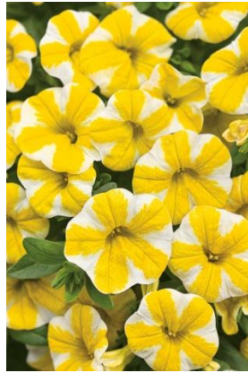
Calibrachoa 'Lemon Slice'