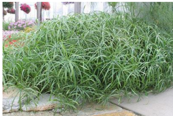
Cyperus 'Baby Tut'