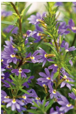
Scaevola 'Whirlwind Blue'