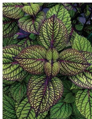
Coleus 'Fishnet Stockings'