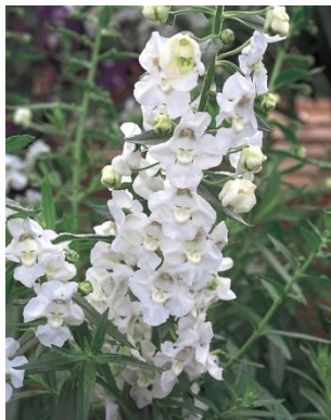
Angelonia 'Angelface White'