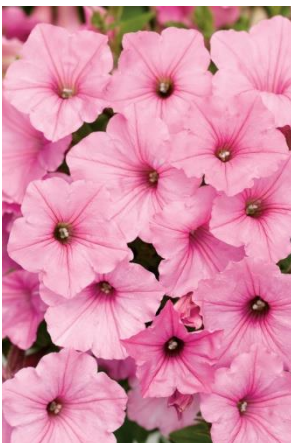
Pentunia 'Vista Bubblegum'