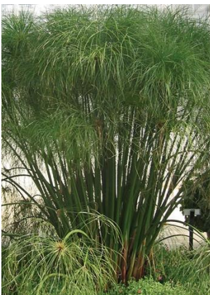
Cyperus 'King Tut'