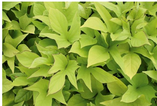
Ipomoea 'Light Green'