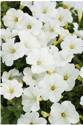
Pentunia 'Mini White'