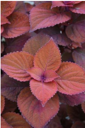
Coleus 'Keystone Kopper'