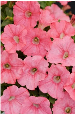
Pentunia 'Bermuda Beach'