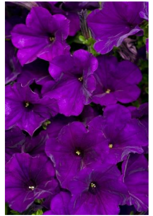
Pentunia 'Royal Velvet'