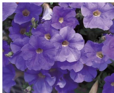
Pentunia 'Sky Blue'