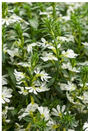
Scaevola 'Whirlwind White'